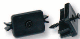
Clips & Screws 20 clips per m 2