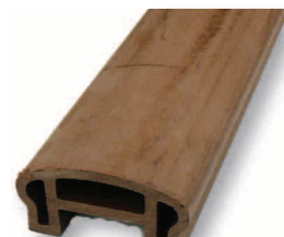
Curved Handrail 100 x 50 x 1800mm