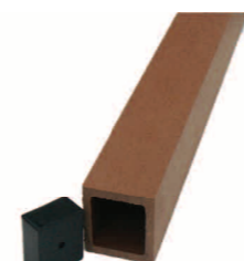
Spindles inc. spigots 50 x 50 x 900mm