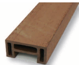
Bottom rail 90 x 45 x 1800mm