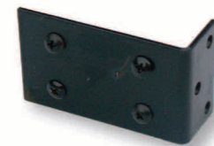
Handrail & Bottom Bracket inc. screws