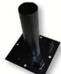
Post Bracket inc. screws