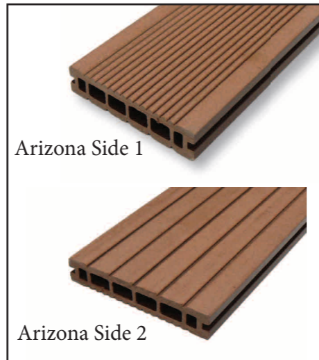
Arizona Side 1

MONTANA Hollow Decking 135 x 25 x 3600mm 0.486m 2 per length