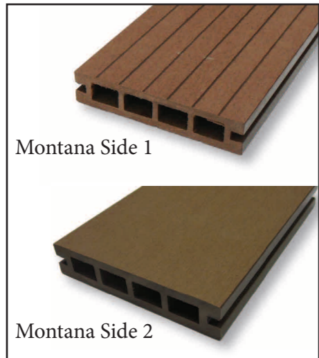
Montana Side 1