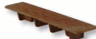
End Piece For hollow decking ends