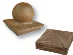
Post Cap Round or Square