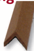
Corner Wrapping 40 x 40 x 3600mm