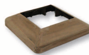
Post Flange 220 x 220mm