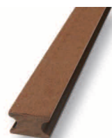
Composite Joist 40 x 25 x 3000mm