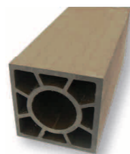
Post 122 x 122 x 1200/2400mm